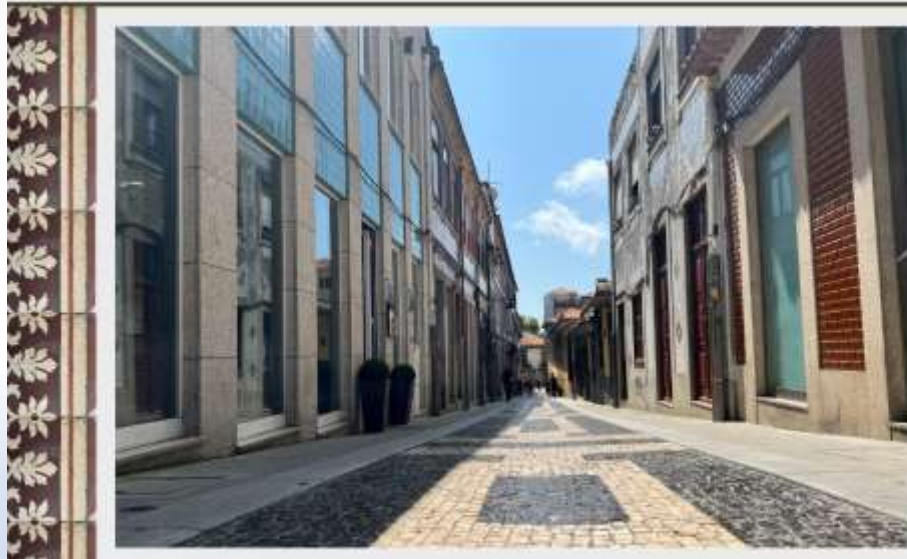
The Travessa de Cedofeita is a picturesque street located in the city center of Porto, Portugal.

This project consists of the reconstruction of 2 historic buildings to build 16 charming studios on the beautiful Rua Travessa de Cedofeita, in one of the most touristy areas of the city of Porto.