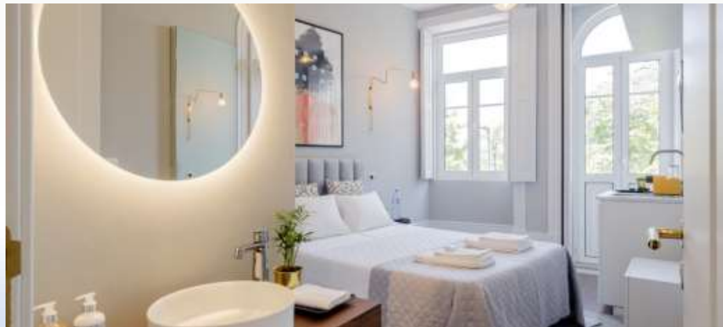
Largo Soares dos Reis – Porto – 10 rooms